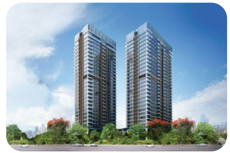
The Branz Apartment TB Simatupang Jakarta, Indonesia