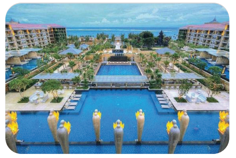
The Mulia Hotel Bali, Indonesia