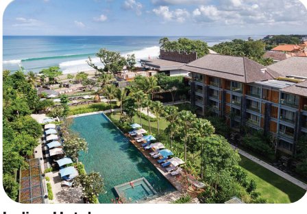
Indigo Hotel Bali, Indonesia