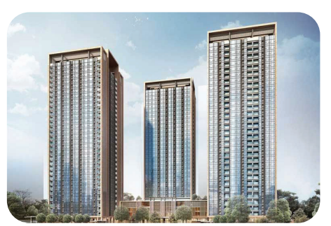
The Branz Apartment BSD Banten, Indonesia