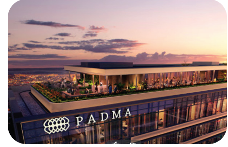
Padma Hotel Semarang, Indonesia