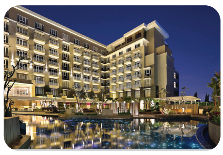
Grand Mercure Hotel Setiabudi Bandung, Indonesia