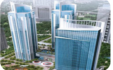
Residence 8 Senopati Jakarta, Indonesia