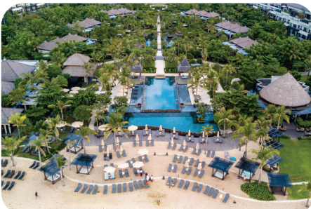
Ritz Carlton Hotel Bali, Indonesia