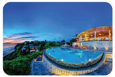
Karma Kandara Bali, Indonesia