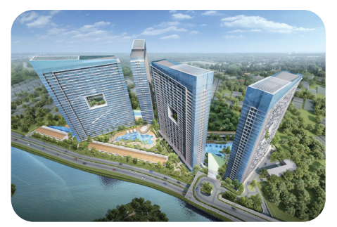
Puri Mansion Apartment Jakarta, Indonesia