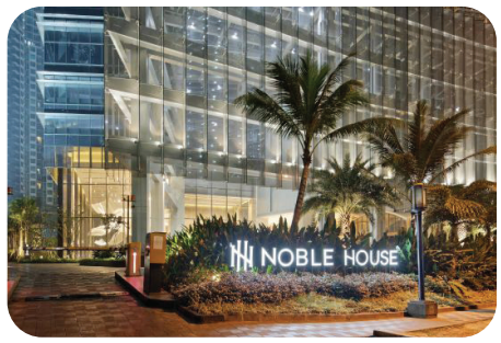
Noble House Mega Kuningan Jakarta, Indonesia