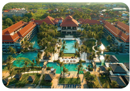
Conrad Hotel Bali, Indonesia