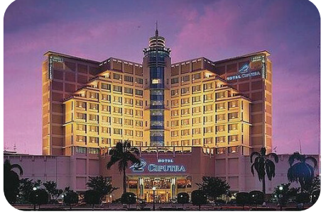
Ciputra Hotel Semarang, Indonesia