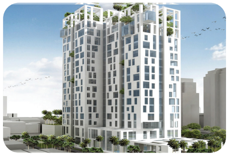
Aloft TB Simatupang Jakarta, Indonesia